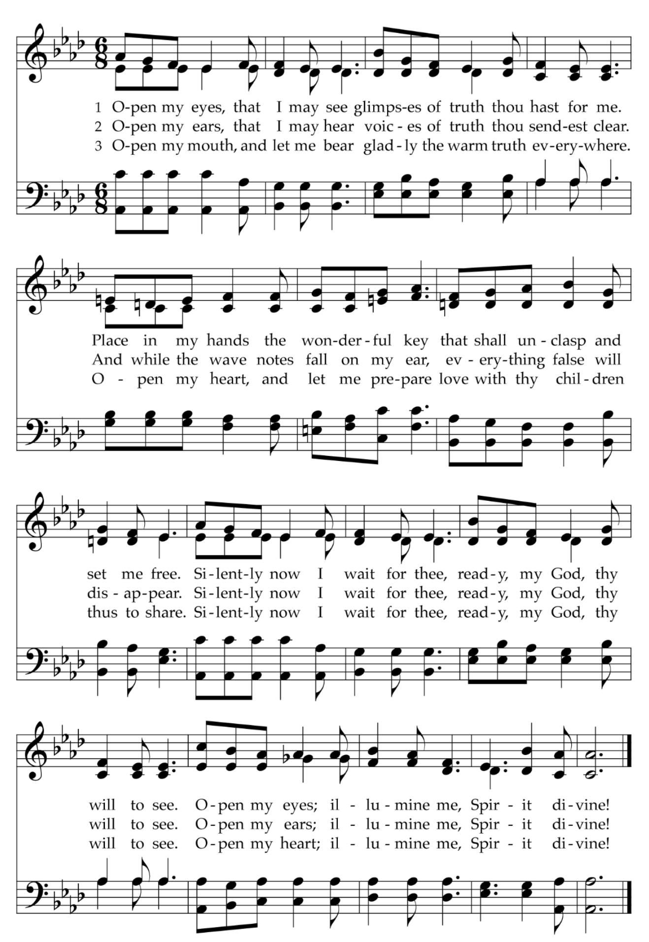
The first woman to publish a collection of her own anthems, this author/composer has created in this hymn a sung prayer for illumination. It not only asks God to help us understand Scripture but also prays for the strength and courage to make God's love known to others.