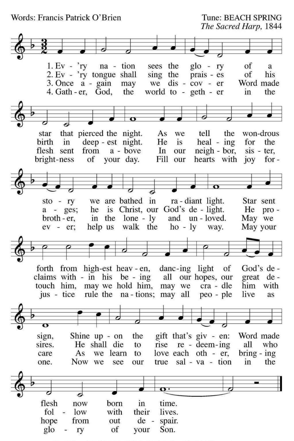
Words Copyright © 2002 by GIA Publications, Inc. All Rights Reserved