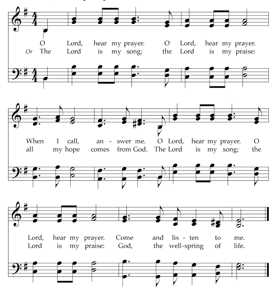
Hymn #471 O Lord, Hear My Prayer

Comment on Facebook if you have a joy or concern to be shared. You can also email or call the church with prayer concerns. Tomorrow we will send a list of prayer concerns over email to our community.