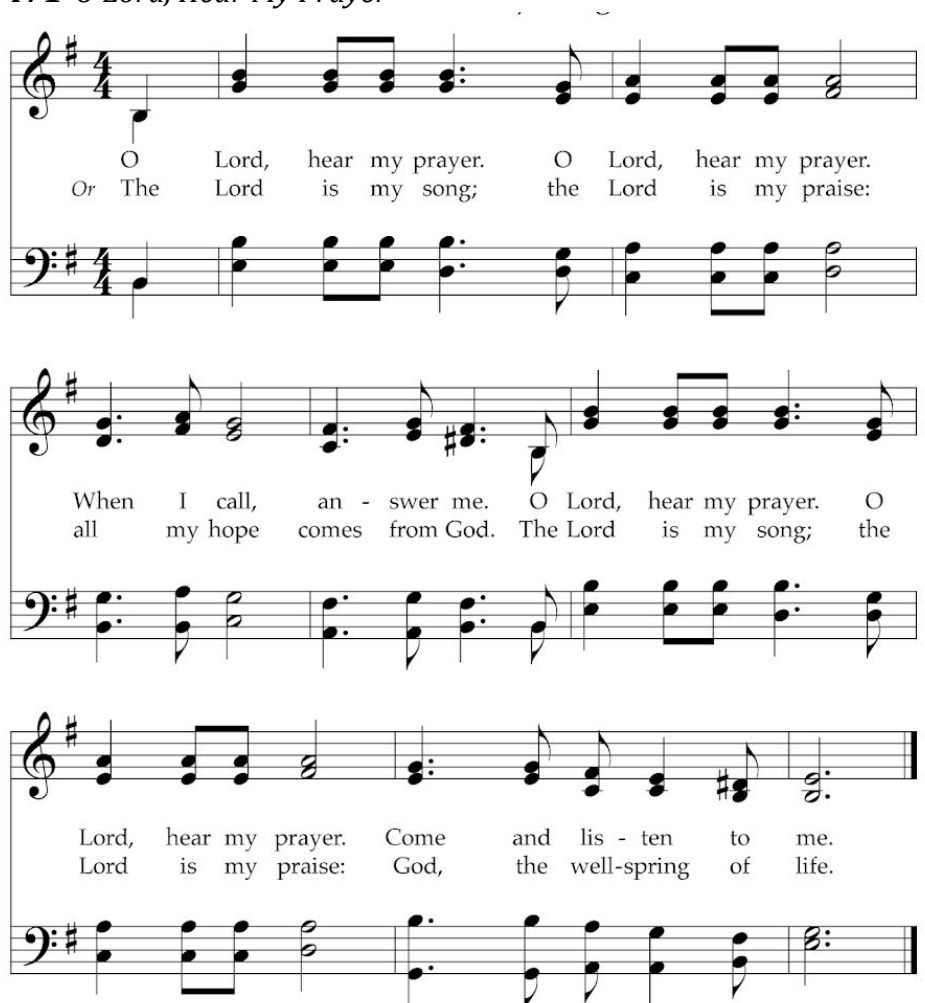
Hymn #471 O Lord, Hear My Prayer

Comment on Facebook if you have a joy or concern to be shared. You can also email or call the church with prayer concerns. Tomorrow we will send a list of prayer concerns over email to our community.