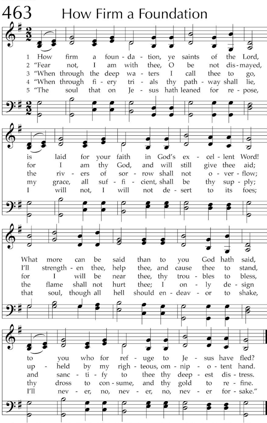
It seems odd now to think of singing this text to ADESTE FIDELES, but mainline churches did so well into the 20th century because of a cultural bias against shape note music. The vigor of the present tune seems especially right for the final line's reference to Hebrews 13:5.