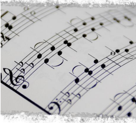
Psalm 13:6, NRSV

I will sing to the LORD, because he has dealt bountifully with me.